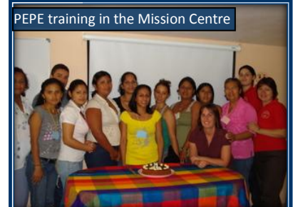
PEPE training in the Mission Centre